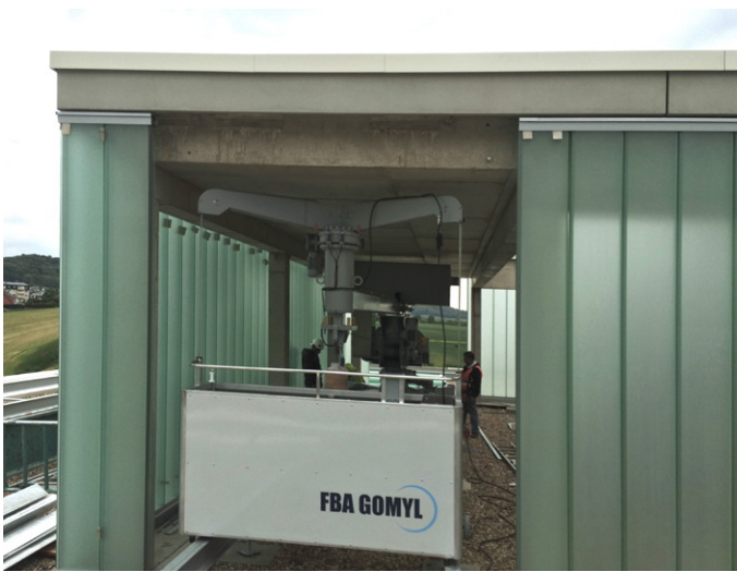
BMU parking zone.