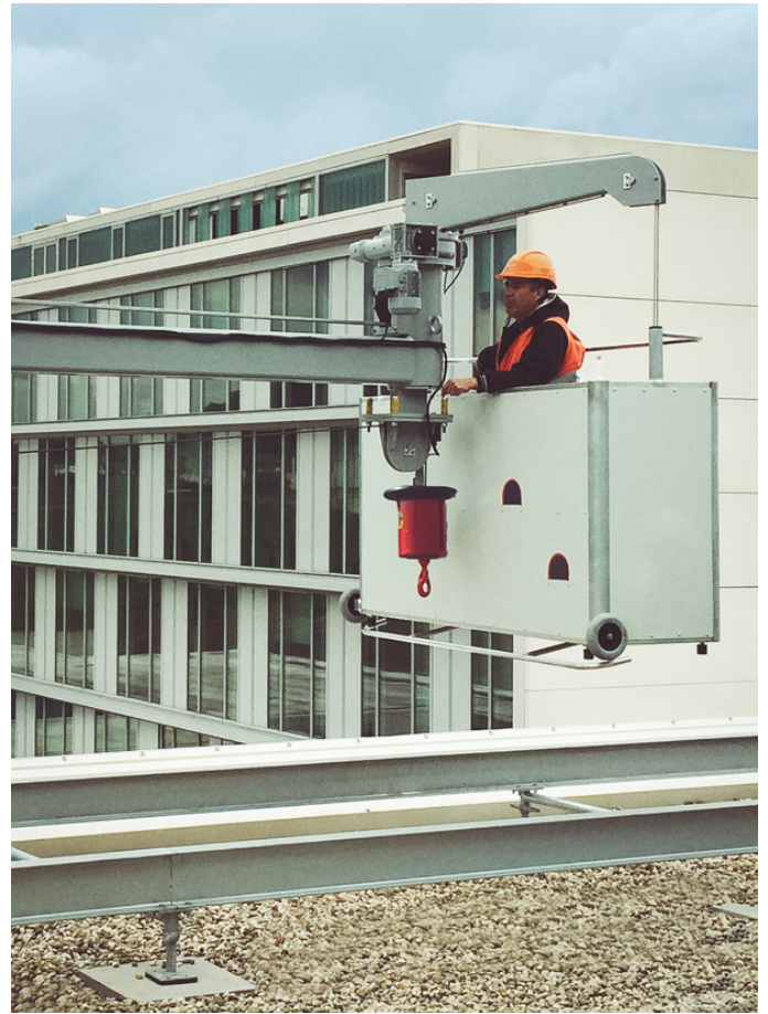
BMU's cradle with a 400kg material hoist.