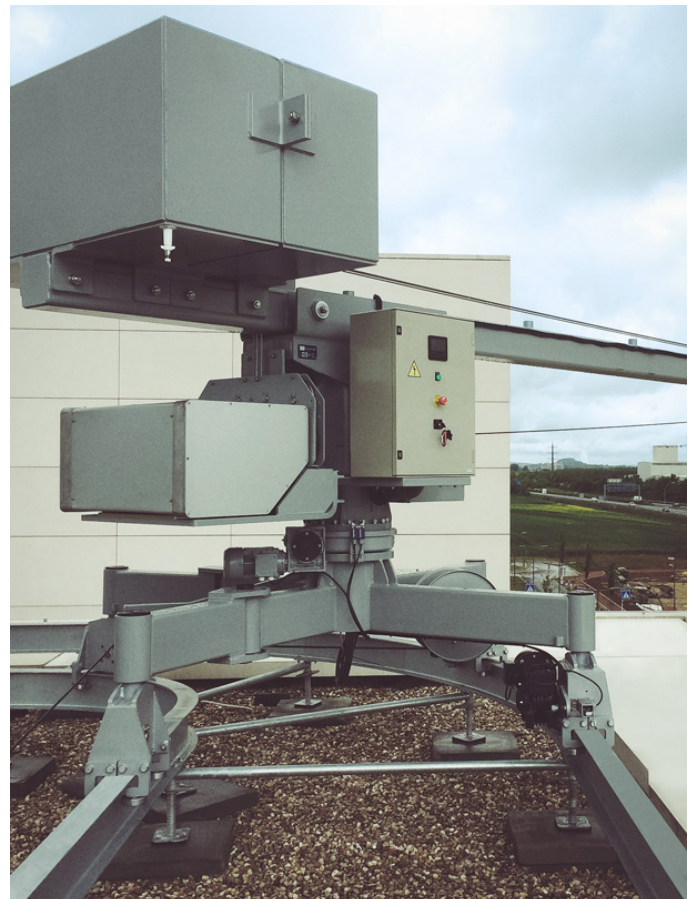
BMU Type FBA 1

This Project is a typical example of an integrated engineering solution.