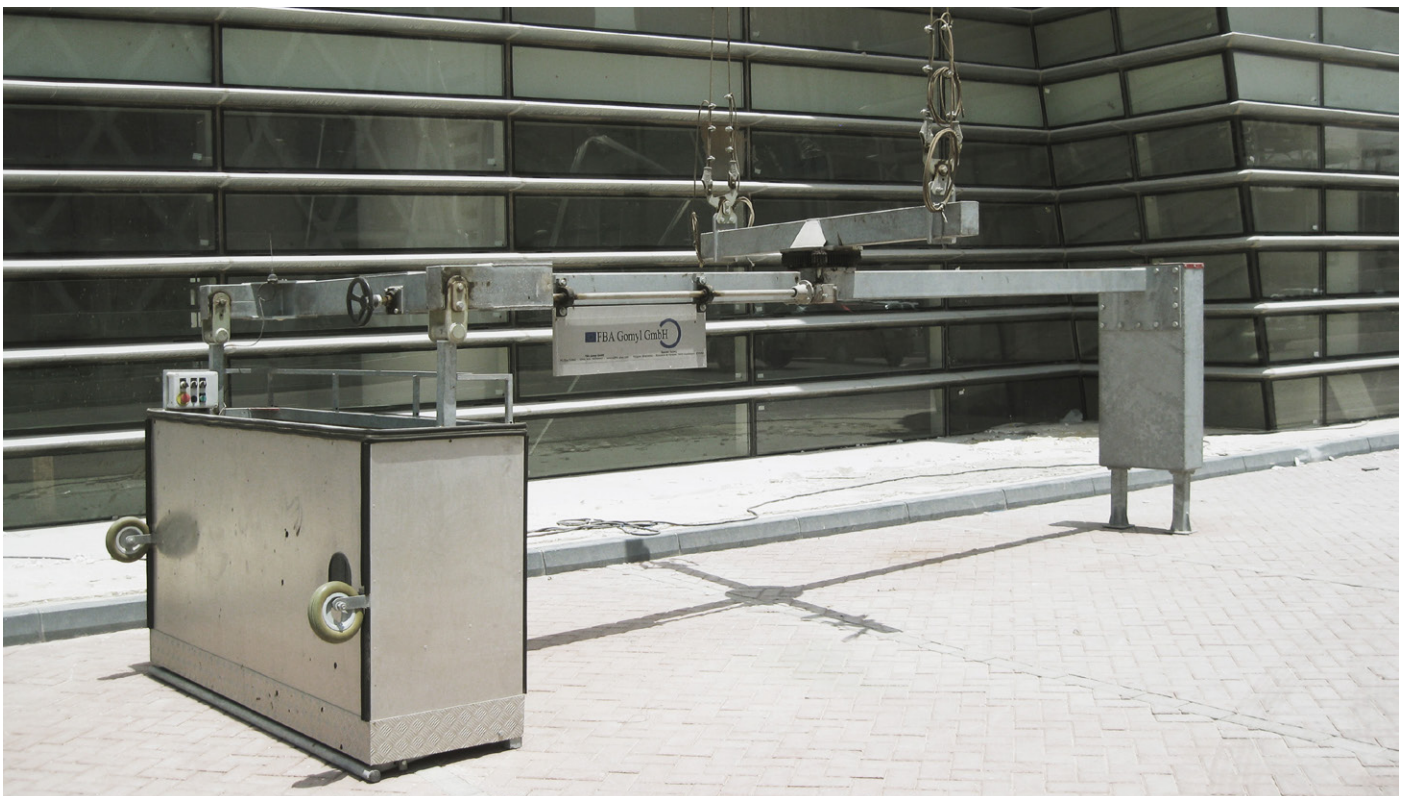
Cradle with 2 meter pantograph.