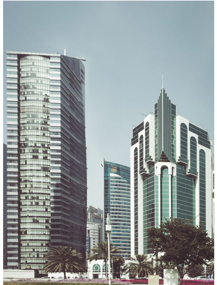
The ministry building in West Bay Doha's district.

FBA Gomyl engineers worked closely with the structural engineers of the building to find out the limits of weight and then to work out a solution by installing a SafeAccess monorail on the sloped part of the building. For the recessed areas, a fixed pantograph of 2m reach has been designed. The BMU is equipped with a knuckle boom to reach all facades of the building.