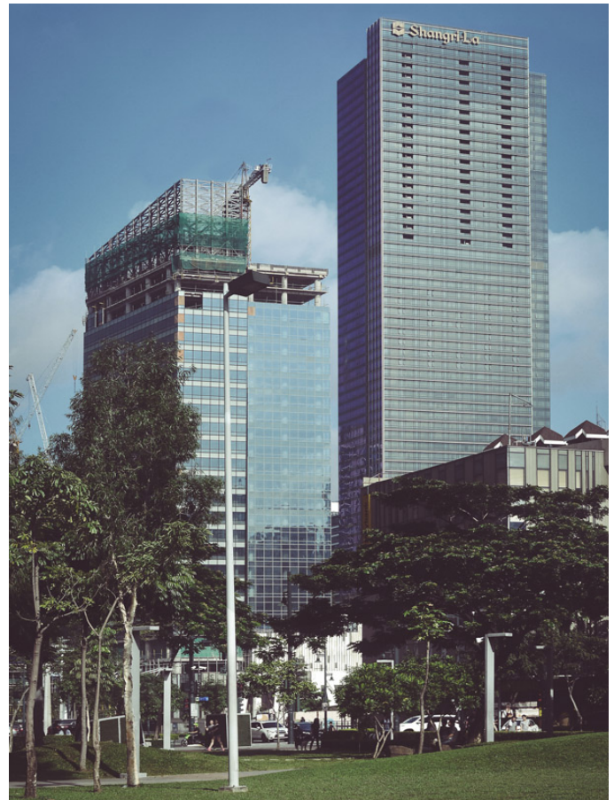
The complex still under construction.

A Building Maintenance Unit of type FBA S has been installed on a double rail track. To keep the long jib when the BMU behind the main parapet is at parking position, the unit has been equipped with a hydraulically operated mast with a stroke of 4,5m.